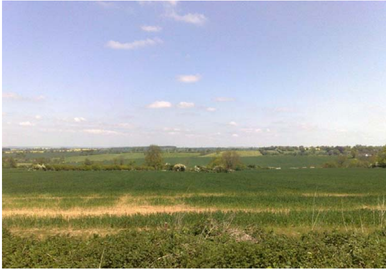
Here's a picture of the view from the back of the house over rolling countryside