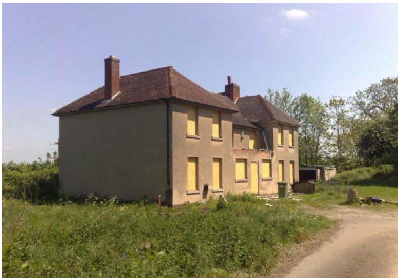
As you can see I have boarded up the property. I will demolish it as soon as I get planning permission to do so