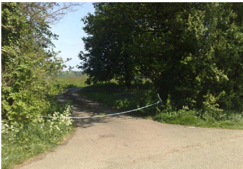
Here's the chain at the front. This stops people driving onto the land